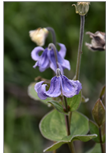
Stand By Me Bush Clematis flowers