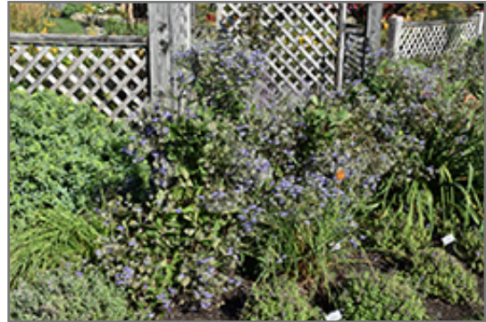
Stand By Me Bush Clematis in bloom

Stand By Me Bush Clematis makes a fine choice for the outdoor landscape, but it is also well-suited for use in outdoor pots and containers. Because of its height, it is often used as a 'thriller' in the 'spiller-thriller-filler' container combination; plant it near the center of the pot, surrounded by smaller plants and those that spill over the edges. It is even sizeable enough that it can be grown alone in a suitable container. Note that when grown in a container, it may not perform exactly as indicated on the tag - this is to be expected. Also note that when growing plants in outdoor containers and baskets, they may require more frequent waterings than they would in the yard or garden. Be aware that in our climate, most plants cannot be expected to survive the winter if left in containers outdoors, and this plant is no exception. Contact our experts for more information on how to protect it over the winter months.