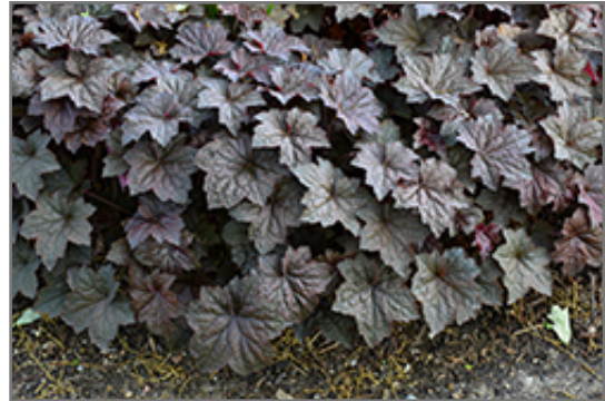
Palace Purple Coral Bells

Palace Purple Coral Bells will grow to be about 12 inches tall at maturity extending to 24 inches tall with the flowers, with a spread of 12 inches. When grown in masses or used as a bedding plant, individual plants should be spaced approximately 10 inches apart. Its foliage tends to remain dense right to the ground, not requiring facer plants in front. It grows at a medium rate, and under ideal conditions can be expected to live for approximately 10 years. As an evergreen perennial, this plant will typically keep its form and foliage year-round.