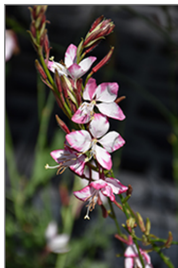
Rosy Jane Gaura flowers