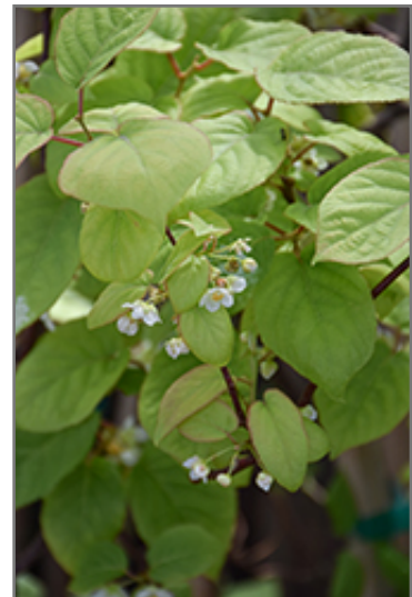
Variegated Hardy Kiwi Vine flowers