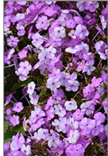
Fashionably Early Princess Garden Phlox flowers

Fashionably Early Princess Garden Phlox is recommended for the following landscape applications;