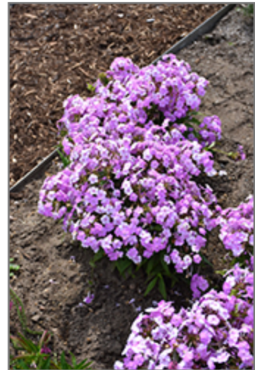
Fashionably Early Princess Garden Phlox in bloom