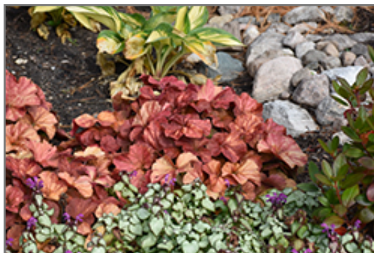
Northern Exposure Amber Coral Bells

Northern Exposure Amber Coral Bells will grow to be about 14 inches tall at maturity, with a spread of 20 inches. When grown in masses or used as a bedding plant, individual plants should be spaced approximately 16 inches apart. Its foliage tends to remain dense right to the ground, not requiring facer plants in front. It grows at a medium rate, and under ideal conditions can be expected to live for approximately 10 years. As an evergreen perennial, this plant will typically keep its form and foliage year-round.