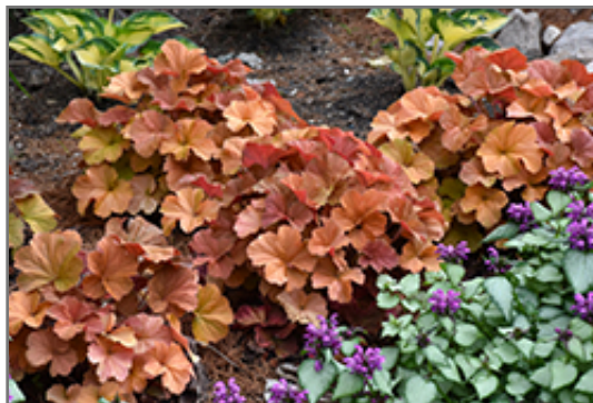
Northern Exposure Amber Coral Bells