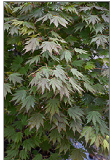
Northern Glow Maple foliage