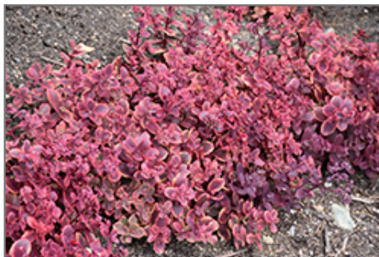
Sunsparkler Wildfire Stonecrop

Sunsparkler Wildfire Stonecrop is a fine choice for the garden, but it is also a good selection for planting in outdoor pots and containers. Because of its spreading habit of growth, it is ideally suited for use as a 'spiller' in the 'spiller-thriller-filler' container combination; plant it near the edges where it can spill gracefully over the pot. Note that when growing plants in outdoor containers and baskets, they may require more frequent waterings than they would in the yard or garden. Be aware that in our climate, most plants cannot be expected to survive the winter if left in containers outdoors, and this plant is no exception. Contact our experts for more information on how to protect it over the winter months.