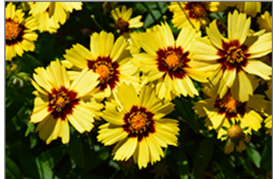
UpTick Yellow and Red Tickseed flowers