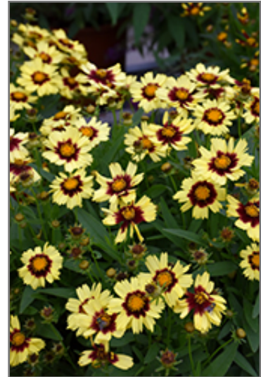
UpTick Yellow and Red Tickseed flowers

UpTick Yellow and Red Tickseed is a fine choice for the garden, but it is also a good selection for planting in outdoor pots and containers. It is often used as a 'filler' in the 'spiller-thriller-filler' container combination, providing a mass of flowers against which the thriller plants stand out. Note that when growing plants in outdoor containers and baskets, they may require more frequent waterings than they would in the yard or garden. Be aware that in our climate, most plants cannot be expected to survive the winter if left in containers outdoors, and this plant is no exception. Contact our experts for more information on how to protect it over the winter months.