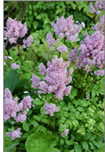
Ice Cream Astilbe flowers