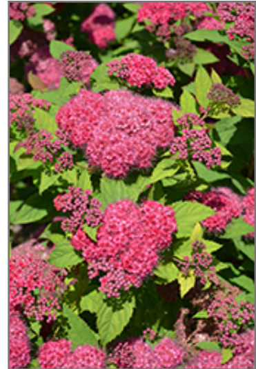
Double Play Red Spirea flowers