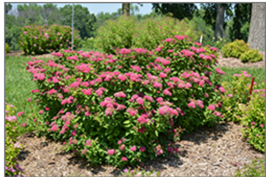
Double Play Red Spirea in bloom