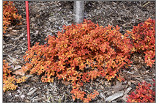
Double Play Candy Corn Spirea

This shrub should only be grown in full sunlight. It prefers to grow in average to moist conditions, and shouldn't be allowed to dry out. It is not particular as to soil type or pH. It is highly tolerant of urban pollution and will even thrive in inner city environments. This is a selected variety of a species not originally from North America.