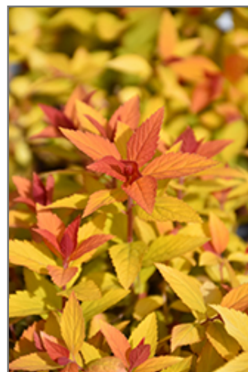
Double Play Candy Corn Spirea foliage