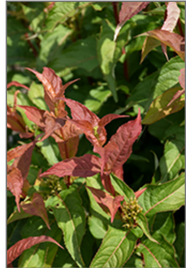
Kodiak Orange Diervilla foliage