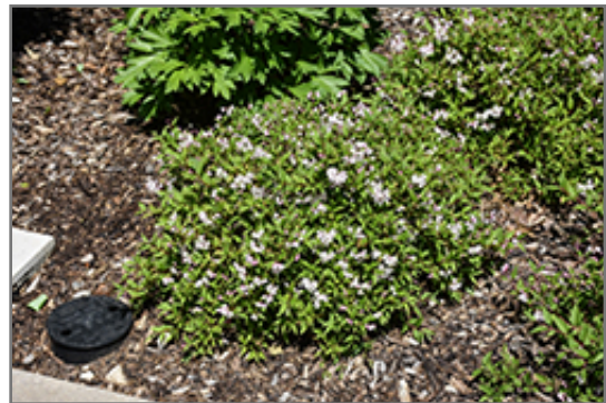
Yuki Cherry Blossom Deutzia in bloom