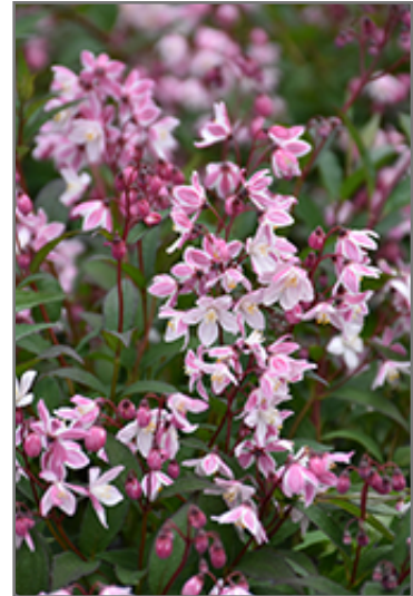
Yuki Cherry Blossom Deutzia flowers