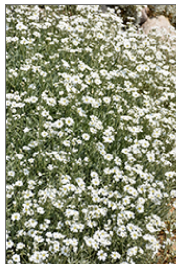
Snow-In-Summer in bloom