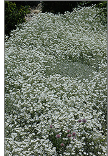
Snow-In-Summer in bloom

Snow-In-Summer is a fine choice for the garden, but it is also a good selection for planting in outdoor pots and containers. Because of its spreading habit of growth, it is ideally suited for use as a 'spiller' in the 'spiller-thriller-filler' container combination; plant it near the edges where it can spill gracefully over the pot. Note that when growing plants in outdoor containers and baskets, they may require more frequent waterings than they would in the yard or garden. Be aware that in our climate, most plants cannot be expected to survive the winter if left in containers outdoors, and this plant is no exception. Contact our experts for more information on how to protect it over the winter months.