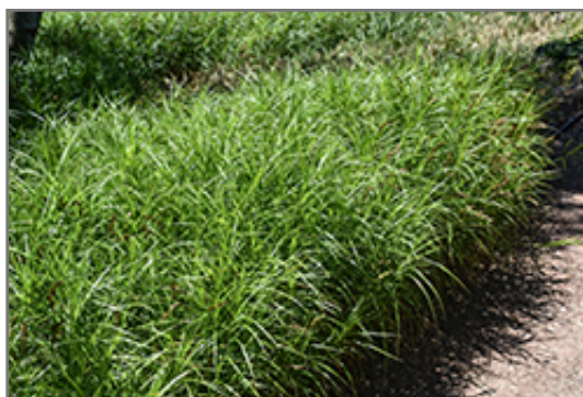
Palm Sedge