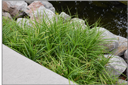
Palm Sedge

Palm Sedge is a fine choice for the garden, but it is also a good selection for planting in outdoor pots and containers. It is often used as a 'filler' in the 'spiller-thriller-filler' container combination, providing a canvas of foliage against which the thriller plants stand out. Note that when growing plants in outdoor containers and baskets, they may require more frequent waterings than they would in the yard or garden. Be aware that in our climate, most plants cannot be expected to survive the winter if left in containers outdoors, and this plant is no exception. Contact our experts for more information on how to protect it over the winter months.