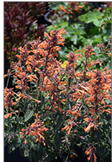
Kudos Mandarin Hyssop flowers