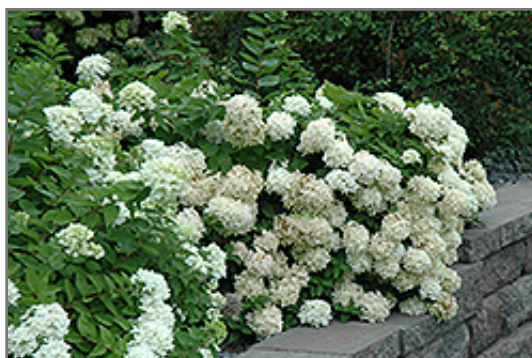
Pee Gee Hydrangea in bloom