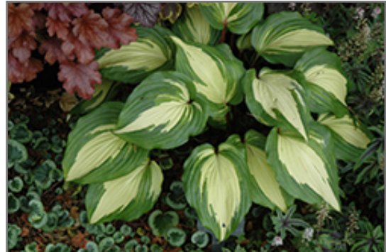
Raspberry Sundae Hosta

Raspberry Sundae Hosta is recommended for the following landscape applications;