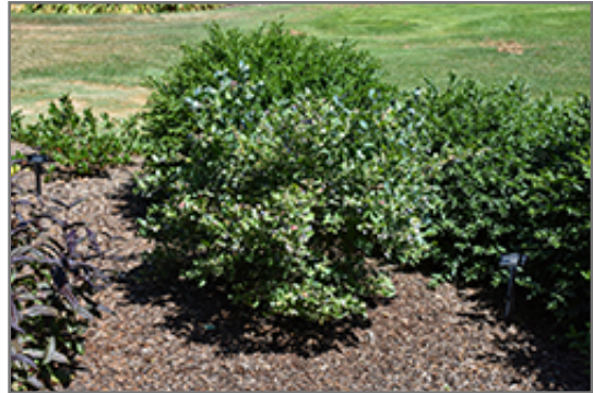
Pink Icing Blueberry