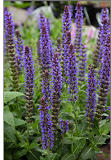
Violet Riot Sage flowers