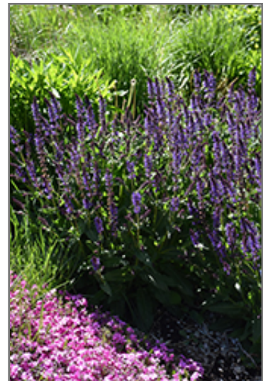
Violet Riot Sage in bloom