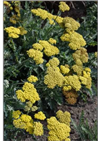
Moonshine Yarrow flowers

Moonshine Yarrow is a fine choice for the garden, but it is also a good selection for planting in outdoor pots and containers. It can be used either as 'filler' or as a 'thriller' in the 'spiller-thriller-filler' container combination, depending on the height and form of the other plants used in the container planting. It is even sizeable enough that it can be grown alone in a suitable container. Note that when growing plants in outdoor containers and baskets, they may require more frequent waterings than they would in the yard or garden. Be aware that in our climate, most plants cannot be expected to survive the winter if left in containers outdoors, and this plant is no exception. Contact our experts for more information on how to protect it over the winter months.