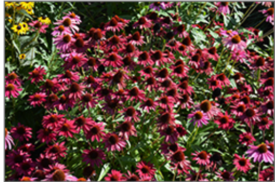
Sombrero Baja Burgundy Coneflower in bloom

Sombrero Baja Burgundy Coneflower will grow to be about 24 inches tall at maturity, with a spread of 20 inches. Its foliage tends to remain dense right to the ground, not requiring facer plants in front. It grows at a medium rate, and under ideal conditions can be expected to live for approximately 10 years. As an herbaceous perennial, this plant will usually die back to the crown each winter, and will regrow from the base each spring. Be careful not to disturb the crown in late winter when it may not be readily seen!