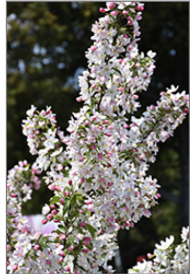
Lancelot Flowering Crab flowers

Lancelot Flowering Crab will grow to be about 8 feet tall at maturity, with a spread of 8 feet. It has a low canopy with a typical clearance of 3 feet from the ground, and is suitable for planting under power lines. It grows at a medium rate, and under ideal conditions can be expected to live for 50 years or more.