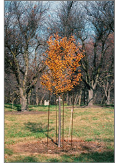
Lancelot Flowering Crab fruit

This shrub should only be grown in full sunlight. It prefers to grow in average to moist conditions, and shouldn't be allowed to dry out. It is not particular as to soil type or pH. It is highly tolerant of urban pollution and will even thrive in inner city environments. This particular variety is an interspecific hybrid.