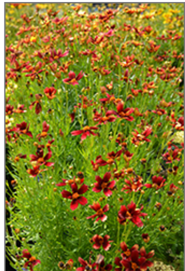
Red Satin Tickseed flowers