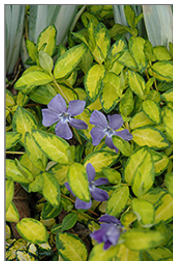
Illumination Periwinkle flowers

Illumination Periwinkle is a fine choice for the garden, but it is also a good selection for planting in outdoor pots and containers. Because of its spreading habit of growth, it is ideally suited for use as a 'spiller' in the 'spiller-thriller-filler' container combination; plant it near the edges where it can spill gracefully over the pot. Note that when growing plants in outdoor containers and baskets, they may require more frequent waterings than they would in the yard or garden. Be aware that in our climate, most plants cannot be expected to survive the winter if left in containers outdoors, and this plant is no exception. Contact our experts for more information on how to protect it over the winter months.