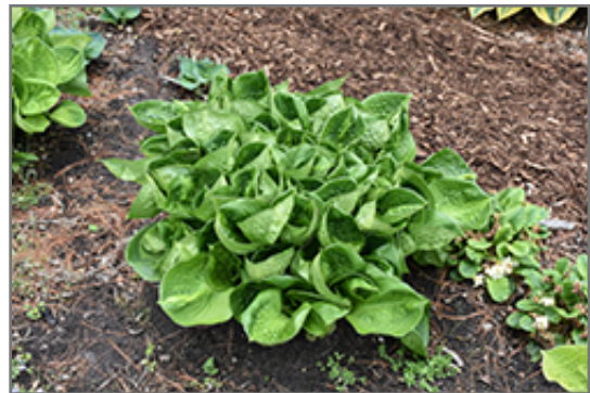
Pocketful Of Sunshine Hosta