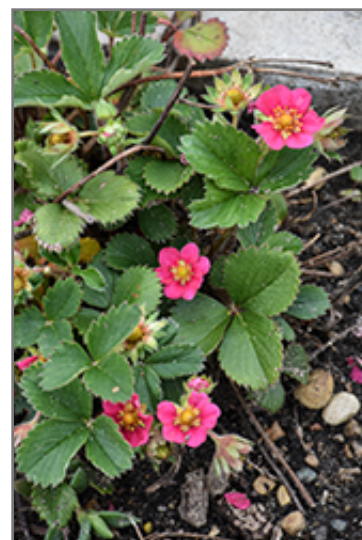
Tristan Strawberry flowers