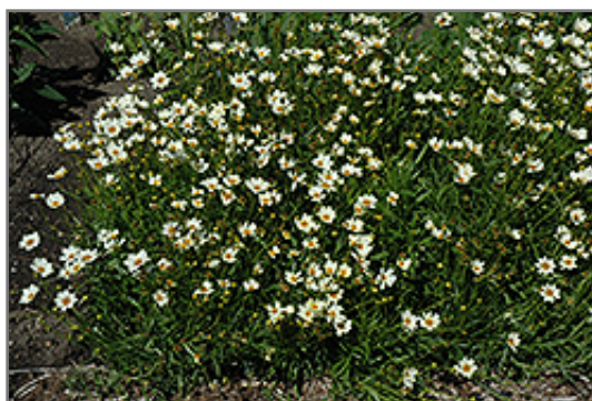
Star Cluster Tickseed in bloom