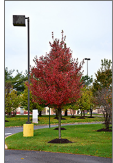
Redpointe Red Maple in fall

This tree should only be grown in full sunlight. It is quite adaptable, preferring to grow in average to wet conditions, and will even tolerate some standing water. It is not particular as to soil type, but has a definite preference for acidic soils, and is subject to chlorosis (yellowing) of the foliage in alkaline soils. It is somewhat tolerant of urban pollution. This is a selection of a native North American species.