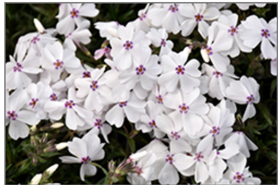
Amazing Grace Moss Phlox flowers