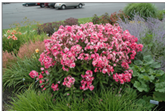
Garden Girls Glamour Girl Garden Phlox in bloom