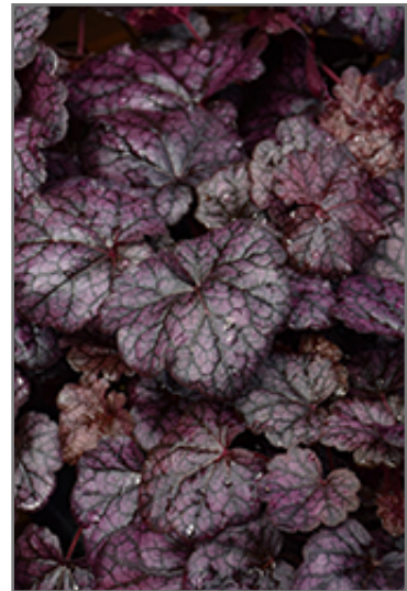
Grape Expectations Coral Bells foliage