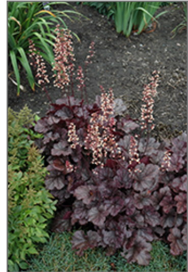
Grape Expectations Coral Bells in bloom

Grape Expectations Coral Bells is recommended for the following landscape applications;