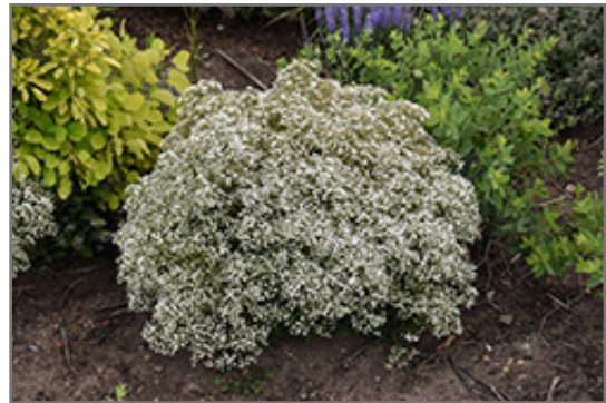
Summer Sparkles Baby's Breath in bloom