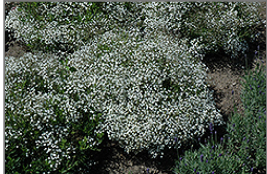
Summer Sparkles Baby's Breath in bloom

This plant should only be grown in full sunlight. It prefers dry to average moisture levels with very well-drained soil, and will often die in standing water. It is considered to be drought-tolerant, and thus makes an ideal choice for a low-water garden or xeriscape application. It is not particular as to soil type, but has a definite preference for alkaline soils, and is able to handle environmental salt. It is highly tolerant of urban pollution and will even thrive in inner city environments. This is a selected variety of a species not originally from North America.