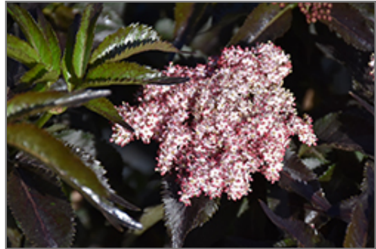
Black Tower Elder flowers

This shrub does best in full sun to partial shade. It is quite adaptable, preferring to grow in average to wet conditions, and will even tolerate some standing water. It is not particular as to soil type or pH. It is highly tolerant of urban pollution and will even thrive in inner city environments. This is a selected variety of a species not originally from North America.