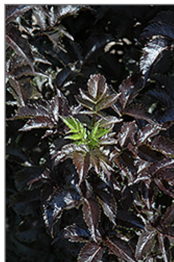
Black Tower Elder foliage

Black Tower Elder is recommended for the following landscape applications;