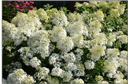
Bobo Hydrangea flowers