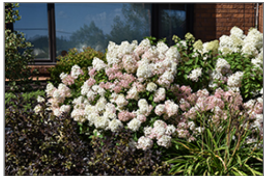
Bobo Hydrangea in bloom