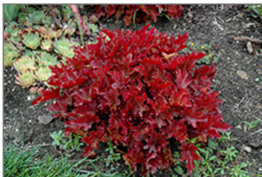
Dolce Cinnamon Curls Coral Bells