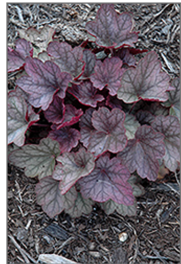
Carnival Rose Granita Coral Bells foliage