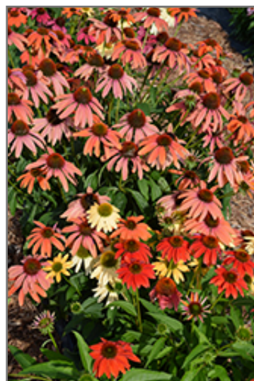
Cheyenne Spirit Coneflower in bloom

Cheyenne Spirit Coneflower is recommended for the following landscape applications;