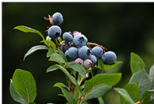
Northland Blueberry fruit

Northland Blueberry is a multi-stemmed deciduous shrub with an upright spreading habit of growth. Its average texture blends into the landscape, but can be balanced by one or two finer or coarser trees or shrubs for an effective composition.