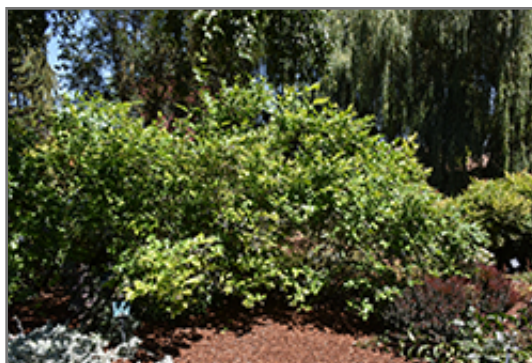
Northland Blueberry