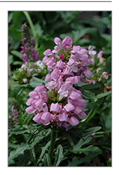
Summer Daze Self Heal flowers

Summer Daze Self Heal will grow to be about 14 inches tall at maturity, with a spread of 18 inches. When grown in masses or used as a bedding plant, individual plants should be spaced approximately 16 inches apart. It grows at a fast rate, and under ideal conditions can be expected to live for approximately 5 years. As an herbaceous perennial, this plant will usually die back to the crown each winter, and will regrow from the base each spring. Be careful not to disturb the crown in late winter when it may not be readily seen!