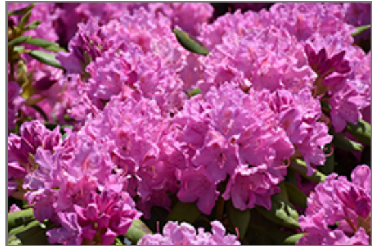
Roseum Elegans Rhododendron flowers