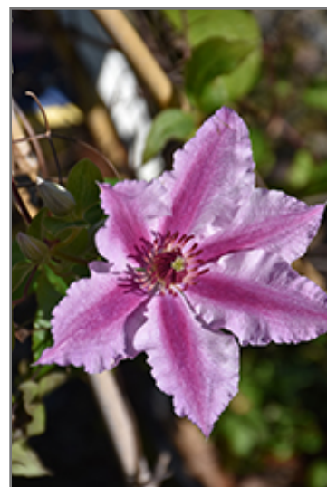
Cherokee Clematis flowers