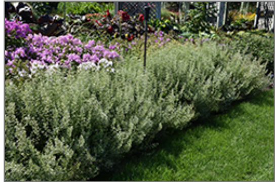
Montrose White Dwarf Calamint in bloom

Montrose White Dwarf Calamint is a fine choice for the garden, but it is also a good selection for planting in outdoor pots and containers. It is often used as a 'filler' in the 'spiller-thriller-filler' container combination, providing a mass of flowers against which the larger thriller plants stand out. Note that when growing plants in outdoor containers and baskets, they may require more frequent waterings than they would in the yard or garden. Be aware that in our climate, most plants cannot be expected to survive the winter if left in containers outdoors, and this plant is no exception. Contact our experts for more information on how to protect it over the winter months.