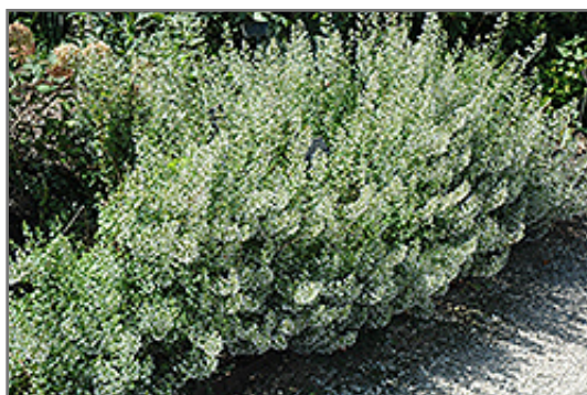
Montrose White Dwarf Calamint in bloom