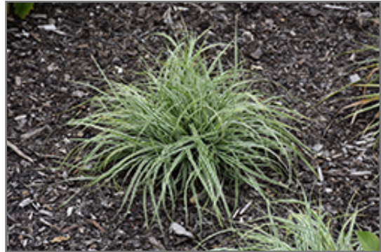
EverColor Everest Japanese Sedge

EverColor Everest Japanese Sedge is a fine choice for the garden, but it is also a good selection for planting in outdoor pots and containers. It is often used as a 'filler' in the 'spiller-thriller-filler' container combination, providing a canvas of foliage against which the thriller plants stand out. Note that when growing plants in outdoor containers and baskets, they may require more frequent waterings than they would in the yard or garden. Be aware that in our climate, most plants cannot be expected to survive the winter if left in containers outdoors, and this plant is no exception. Contact our experts for more information on how to protect it over the winter months.