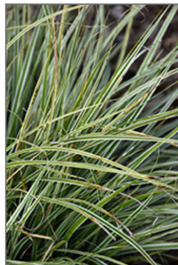
EverColor Everest Japanese Sedge foliage