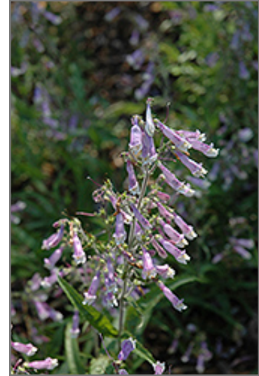
Hairy Beard Tongue flowers

A lovely variety that mounds medium green foliage; deep purple fuzzy stems uphold glorious lavender blooms with white throats and tips that are great for visual impact; plants are vigorous and very drought tolerant