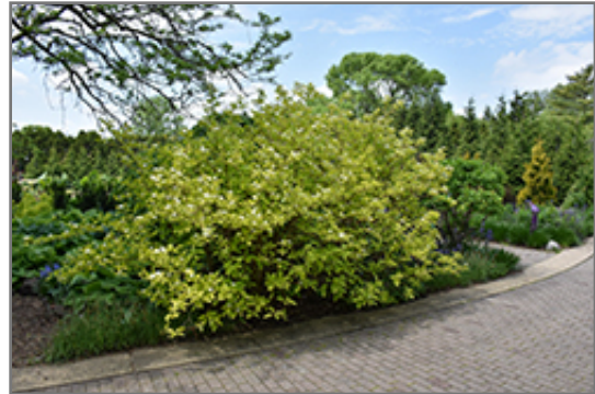
Golden Dogwood in bloom

Golden Dogwood is recommended for the following landscape applications;