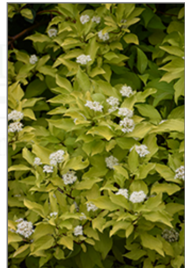
Golden Dogwood flowers