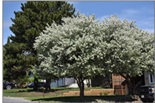
Dolgo Apple in bloom