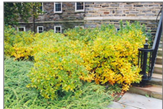
Summersweet in fall