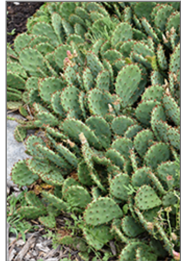
Prickly Pear Cactus

Prickly Pear Cactus is a fine choice for the garden, but it is also a good selection for planting in outdoor pots and containers. Because of its spreading habit of growth, it is ideally suited for use as a 'spiller' in the 'spiller-thriller-filler' container combination; plant it near the edges where it can spill gracefully over the pot. Note that when growing plants in outdoor containers and baskets, they may require more frequent waterings than they would in the yard or garden. Be aware that in our climate, most plants cannot be expected to survive the winter if left in containers outdoors, and this plant is no exception. Contact our experts for more information on how to protect it over the winter months.