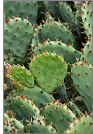
Prickly Pear Cactus foliage

Prickly Pear Cactus is a member of the cactus family, which are grown primarily for their characteristic shapes, their interesting features and textures, and their high tolerance for hot, dry growing environments. As an 'opuntiad' type of cactus, it doesn't actually have leaves, but rather modified succulent stems that comprise the bulk of the plant, and which are designed to retain water for long periods of time. This particular cactus is valued for its spreading habit of growth. This plant features showy yellow cup-shaped flowers at the ends of the stems from mid spring to mid summer. It produces red berries in late summer.