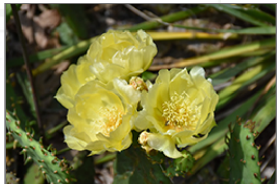
Prickly Pear Cactus flowers